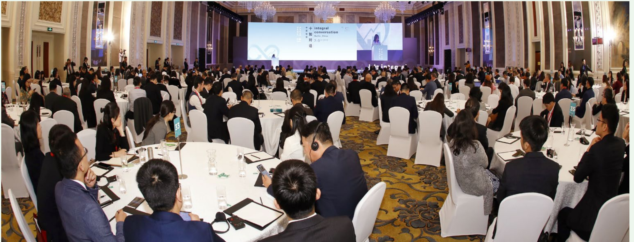
Hosted by Esquel Group, 2019 Integral Conversation came to a successful end.