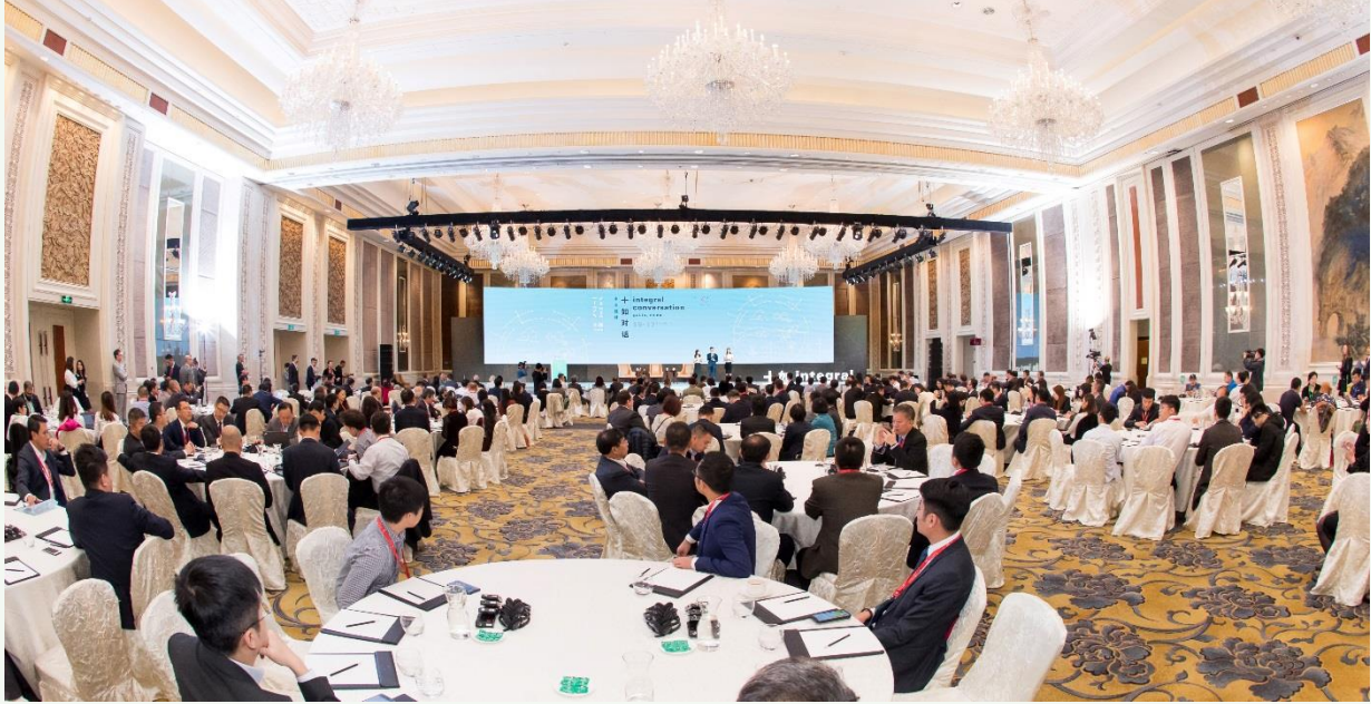
Hosted by Esquel Group, 2018 Integral Conversation comes to a successful end with distinguished speakers, business leaders, scholars and other key stakeholders joining the event.