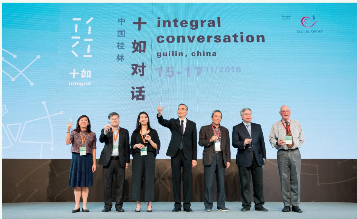
The 2018 Integral Conversation kicked off with a toasting ceremony on the stage.

Dennis Chan dchan3@webershandwick.com (852) 2533 9986