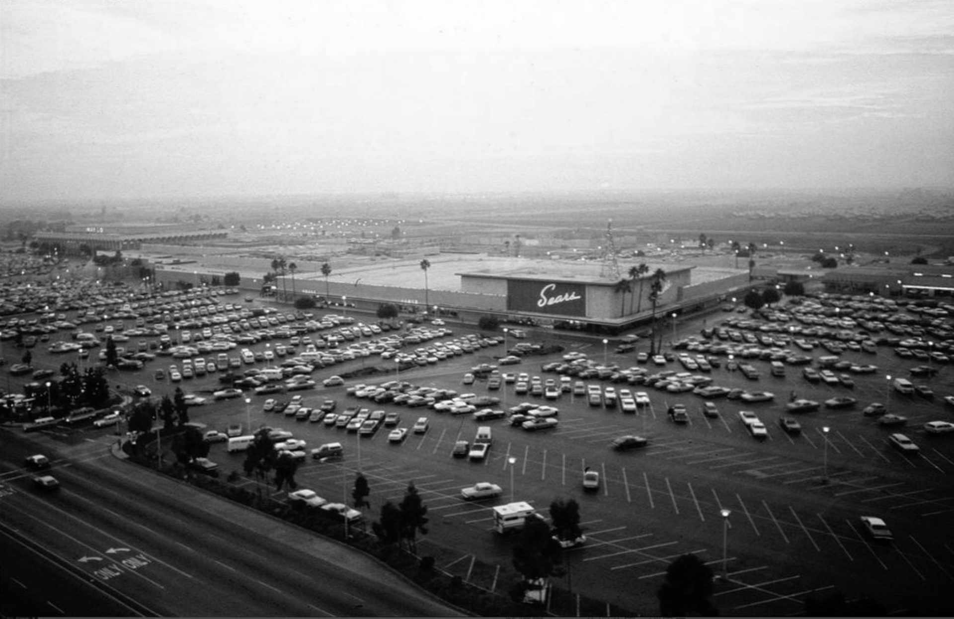
South Coast Plaza, Orange County, California, USA