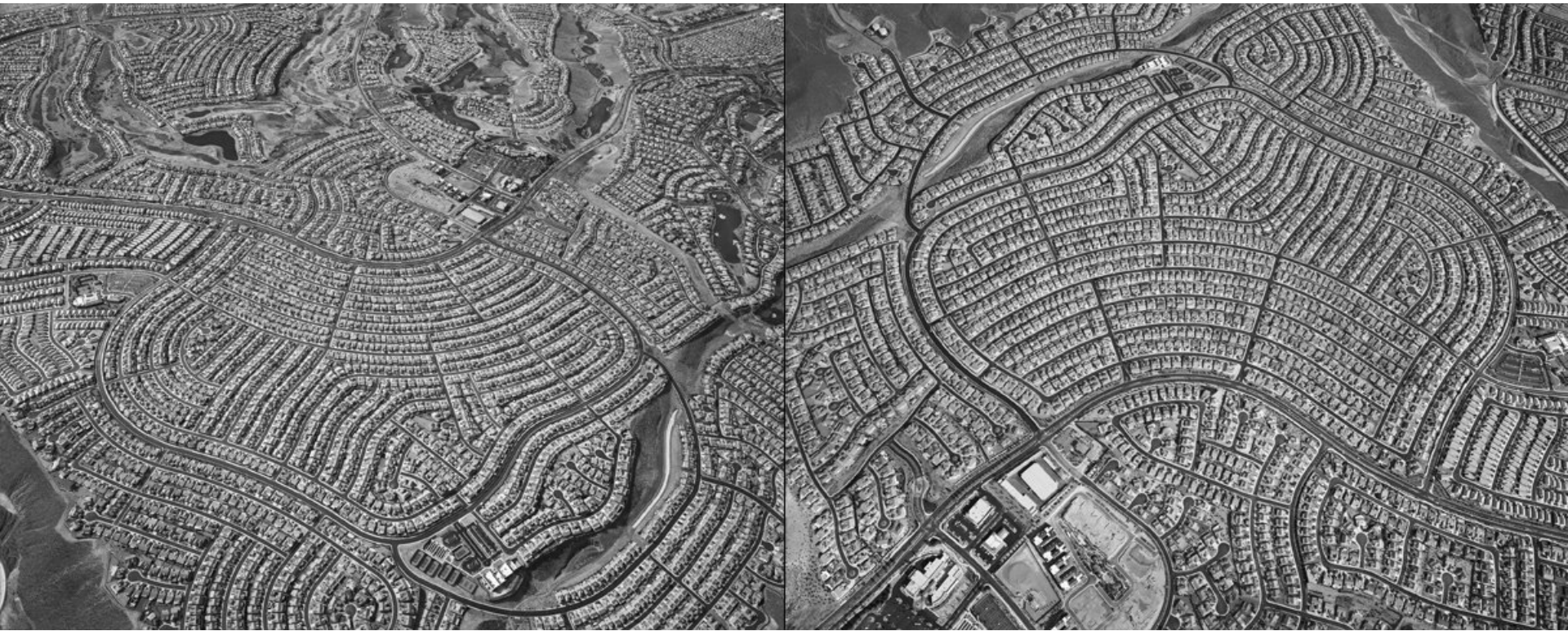
Anthem-Henderson, Nevada, USA