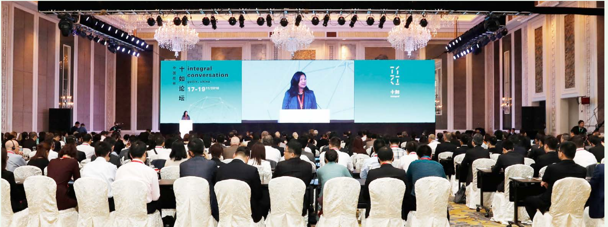
Hosted by Esquel Group, the Integral Conversation 2016 came to a successful end.