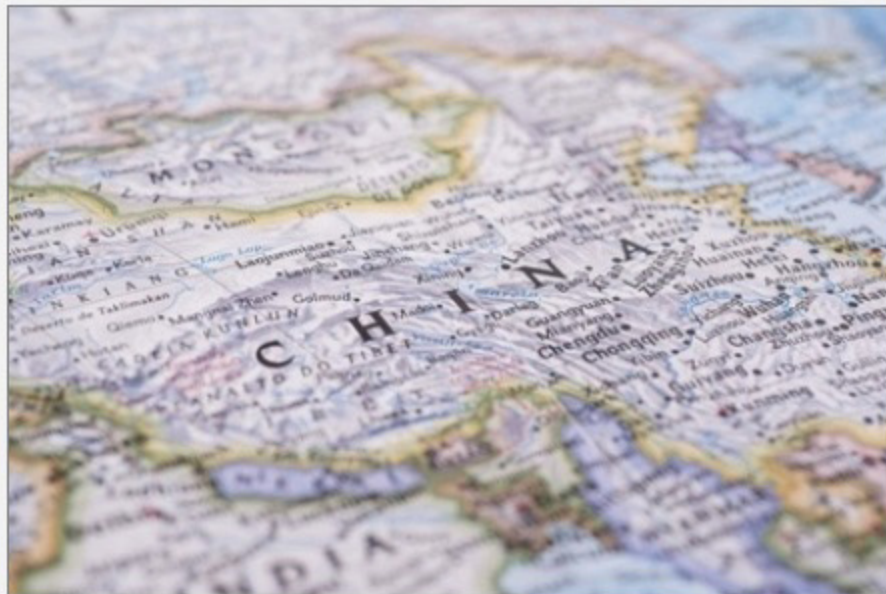
China wants an industry unreliant on cheap labour and poor environmental performance

Indeed, he expects China's domestic demand for good quality textiles and garments to show long-term positive growth, even with China's gross domestic product (GDP) growth next year expected to slow to around 7%.